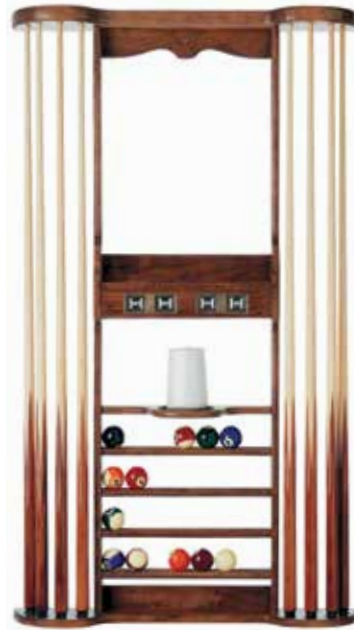
CLASSIC EIGHT-HOLDER WITHOUT MIRROR