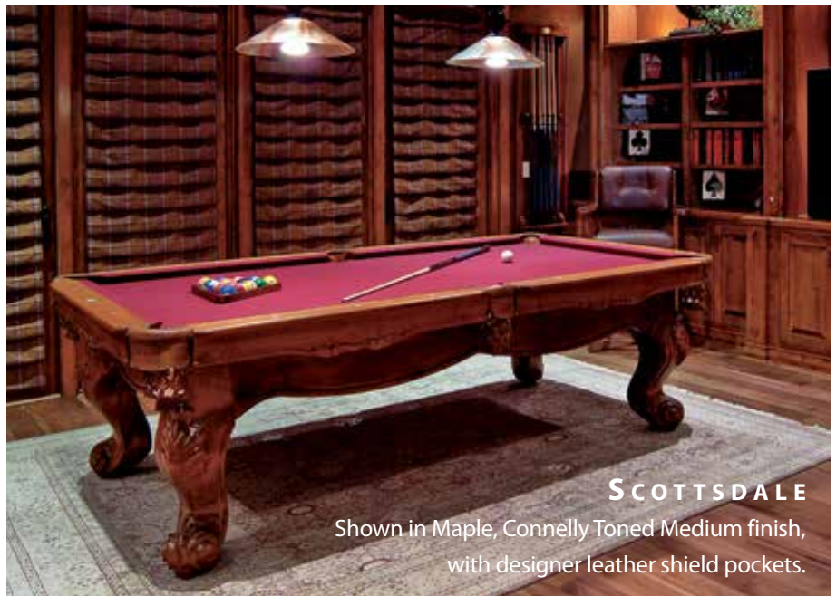
SCOTTSDALE Shown in Maple, Connelly Toned Medium finish, with designer leather shield pockets.

You will discover something that is a huge side benefit, a bonus, that comes from owning a Connelly. It's simply enjoying a true family activity that will bring you and your friends closer together in a game that grows with you while providing laughter, entertainment and great memories.