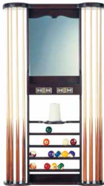
CLASSIC EIGHT-HOLDER WITH MIRROR