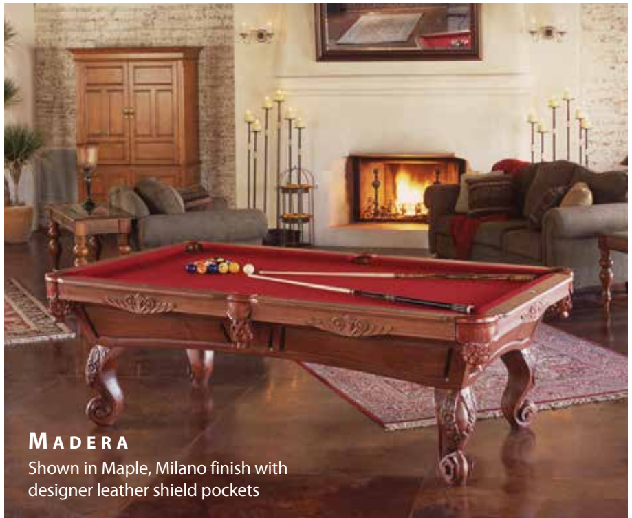
MADERA Shown in Maple, Milano finish with designer leather shield pockets

Connelly Billiards is poised for growth and can deliver an expanded line of game room products. We build every table under one roof and that brings together the best of the best – we create and design, we buy the wood, we cut it and we stain it. If we didn't build it, we don't ship it. That's what makes us unique, we are truly built in Texas, USA. This allows us the flexibility to customize anything and create an entire game room for you. We listen and make things happen.