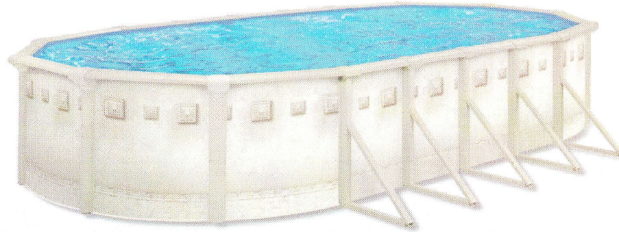
A-Brace oval Millemium - Tuscan wall offered in 52 inches