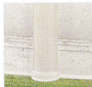
One-piece resin foot collar