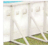
Heavy-duty angle brace system