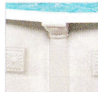
Ledge, cap and post designed for a secure fit