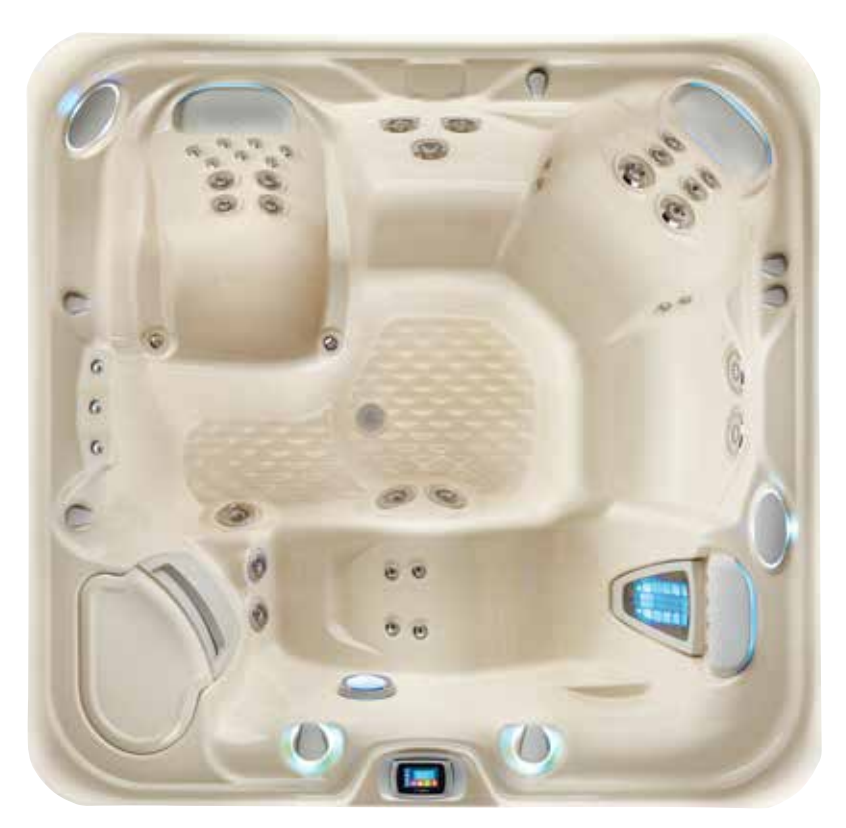
Envoy NXT shell shown in Crème.

See detailed specifications for the Envoy NXT on page 27.