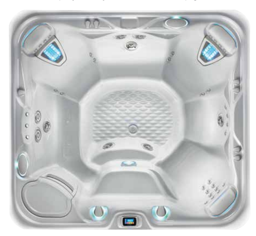
Grandee NXT shell shown in Ice Gray.

See detailed specifications for the Grandee NXT on page 26.