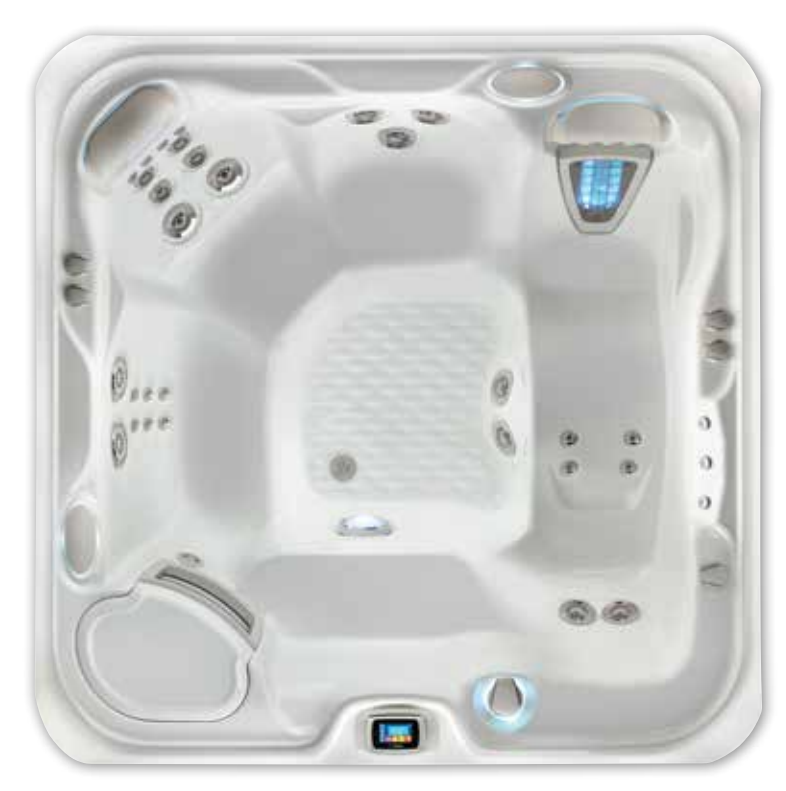
Aria NXT shell shown in Alpine White.

See detailed specifications for the Aria NXT on page 27.