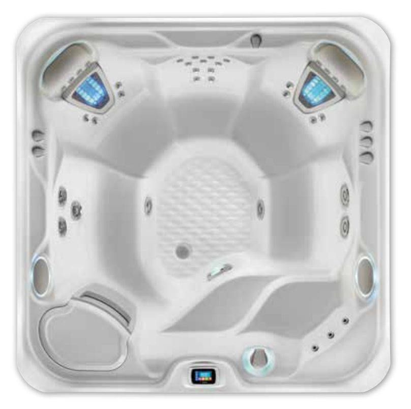
Vanguard NXT shell shown in Alpine White.

See detailed specifications for the Vanguard NXT on page 28.