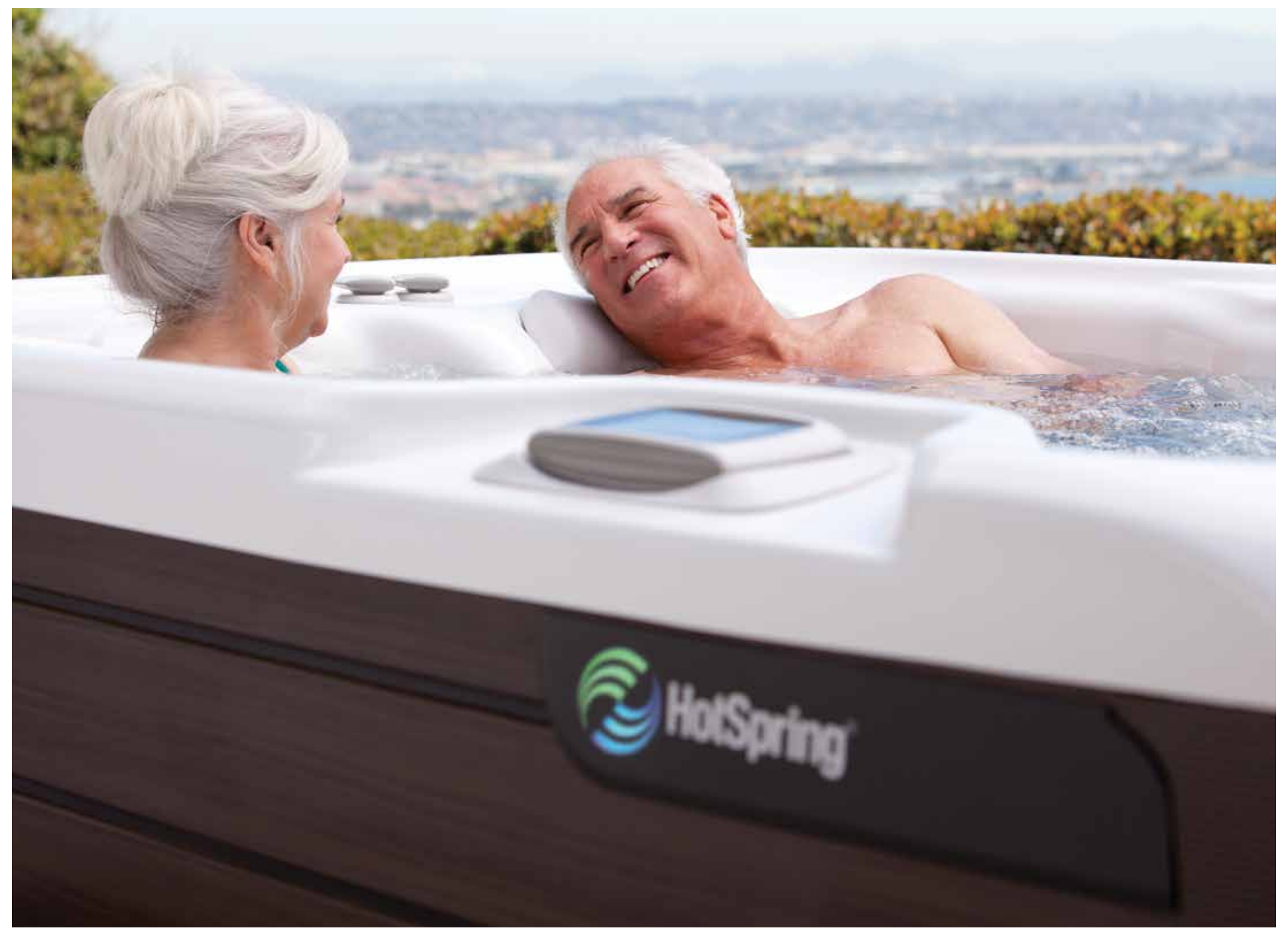
HOT SPRING SPAS HIGHLIFE COLLECTION NXT 25