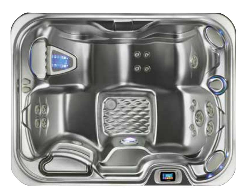
Jetsetter NXT shell shown in Platinum.

See detailed specifications for the Jetsetter NXT on page 28.