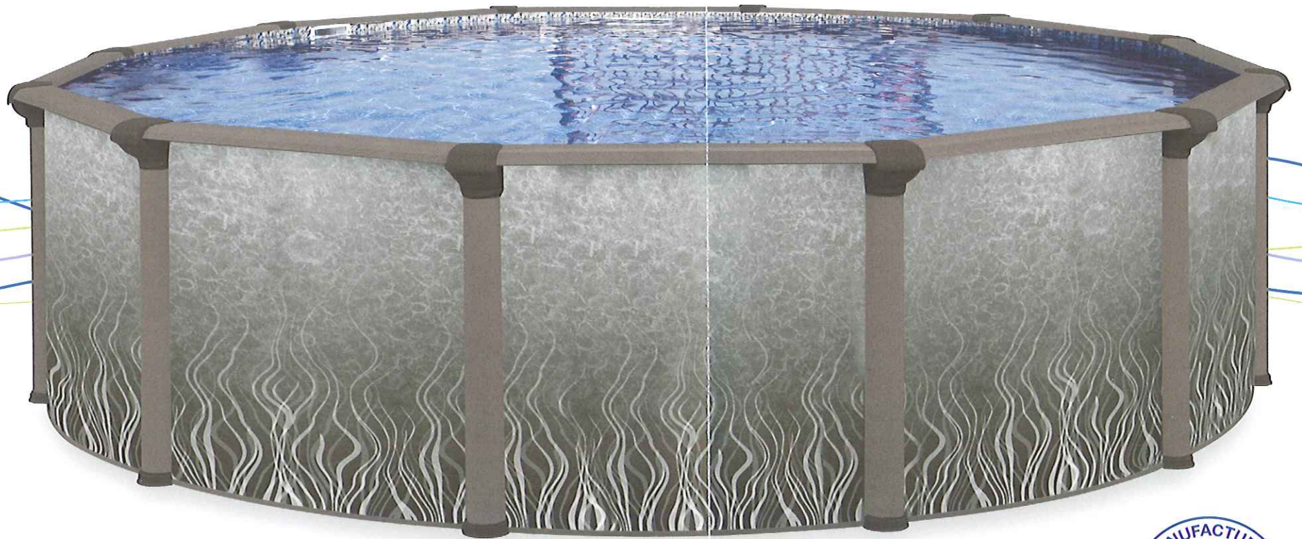
Round Quantum - Coral wall offered in 52 & 54 inches

If you're handy with a screwdriver, then you can easily assemble your QUANTUM pool. We've designed each pool to make installation problem-free—no multi-sized washers or nuts to worry about. Just one large screw type is used to assemble the entire round pool and we provide easy-to-follow instructions.