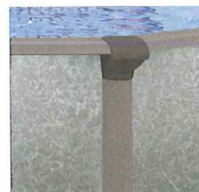
Ledge, cap and post designed for a secure fit