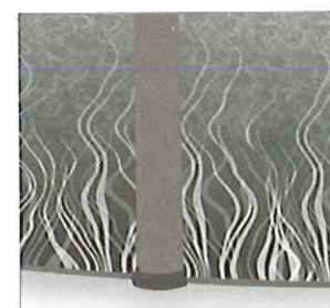
One-piece resin connector/foot collar combo